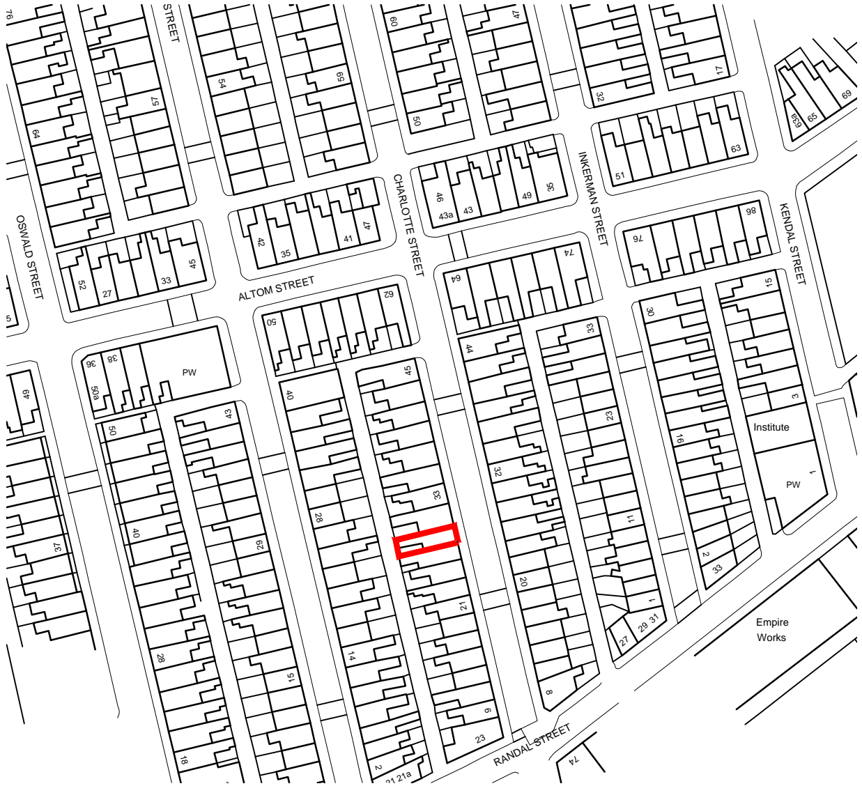
SITE LOCATION PLAN. SCALE 1:1250